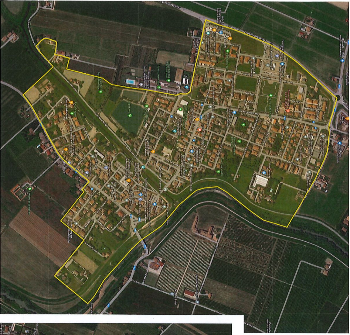
COMUNE DI BOMPORTO