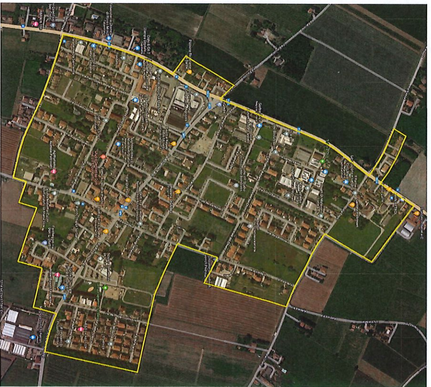
FRAZIONE DI SORBARA

Handwritten signatures in blue ink, including a large signature at the top and several smaller ones below it.